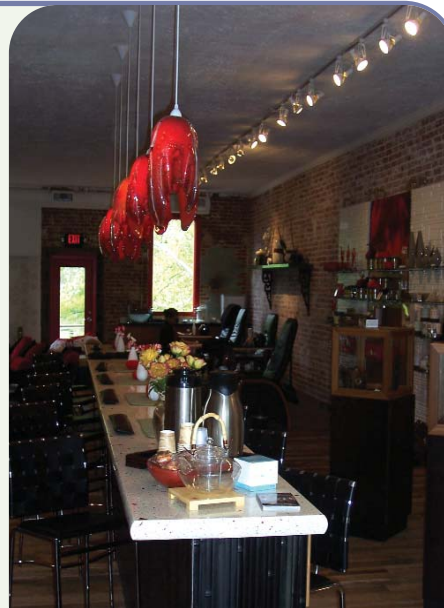
The manicure bar at 10 Ten

I selected a Milk Bath with lavender oil and the Water exfoliation and massage then joined other women in a semicircle facing a pebble-stone wall to sit in a funky foam butterfly chair with cushy red velour pillows while placing my tired feet into a polished stone bowl of warm water and milky foam. Because of its connection to Natural Body, the spa-like environment included candlelight and soothing music (during my visit, French tunes, which truly made me feel like I was getting away from it all.) After the soak, I was escorted to the black leather chairs so commonly found at nail salons, but these weren't your average chairs with not-quite-so-comfortable motorized massagers. Rather here, the zero-gravity chairs reclined me all the way back and a heated aromatherapy pad was placed around my neck and over my eyes. Requesting a luxurious chenille throw, I dozed off as my feet were massaged and babied.