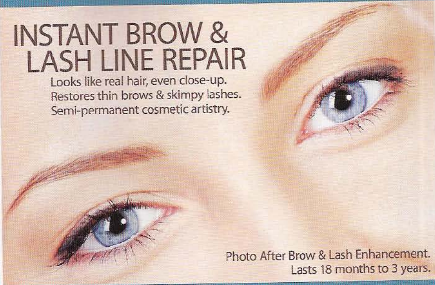
Photo After Brow & Lash Enhancement. Lasts 18 months to 3 years.

Looks like real hair, even close-up. Restores thin brows & skimpy lashes. Semi-permanent cosmetic artistry.